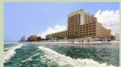
Daytona Beach Resort and Conference Center 2700 N. Atlantic Ave., Daytona Beach, FL 32118 Phone: 800-654-6216

Check out the hotel at www.daytonabeachresort.com/ . ■