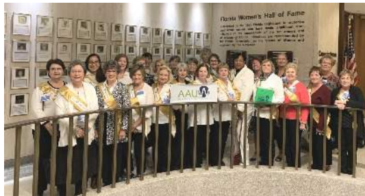
Lobby Day 2020 participants.

AAUW FL members were well represented in Tallahassee events in January and February.