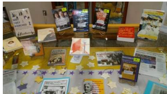
Educating, collaborating. The Flagler County branch partnered with the county library to create a display of women's suffrage books and DVDs during the week of Women's Equality Day 2019.

Anthony first introduced the concept of Equal Pay for Equal Work when she published The Revolution in 1868? Are you ready to advocate as the suffragists did?