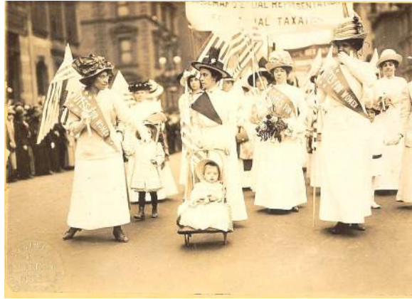
The Legacy. Suffragists often wore white as they advocated for the right to vote, as these women did in a New York City march, May 6, 1912.

Equal Pay amendments are being debated at state and local levels. Equal Pay Day is right around the corner. How many of us knew Susan B.