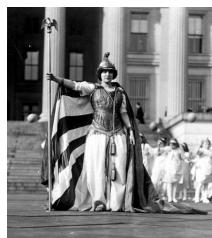
March 1913 DC Parade

A special THANK YOU to the people and businesses that help dreams come true for Manatee girls and women.