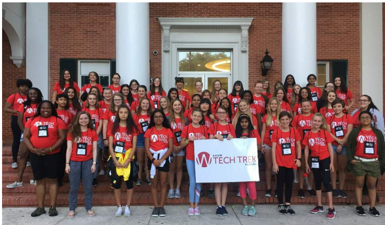
Campers and staff at Tech Trek 2019 at Stetson University, DeLand, above, and at Florida Atlantic University, Jupiter,