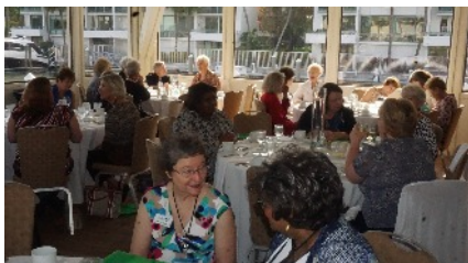
Water views with meals.