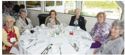
Lunch in the Boat House.